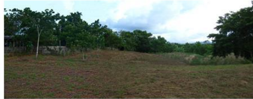
Site for Future Orphanage

Planning is underway to begin the construction of a new orphanage in a nearby residential area. Land is ready for construction, design plans have been developed, and fund raising has begun. The new orphanage will accommodate up to 94 children plus four adult workers.